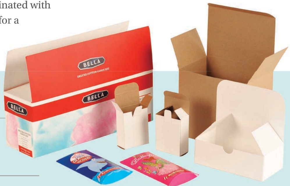
PLAIN & PRINTED CHIPBOARD & SBS FOLDING CARTONS

We also offer Set-Up Boxes for very high-end retail applications. These boxes are already “set-up” and are produced with heavy caliper chipboard with a printed litho wrap. Interiors can be enhanced with either a vacuum formed clamshell or with a die-cut foam insert laminated with a “velvet-like” material for a super premium finish.