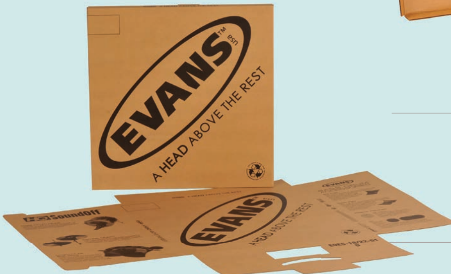
PRINTED DIE CUT