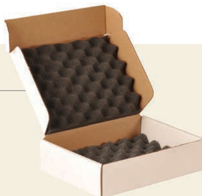
CONVOLUTED FOAM LAMINATED TO MAILER