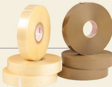
POLY PRO TAPE 2x1000 YARDS