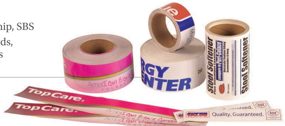
“PRESSURE SENSITIVE” PRINTED LABELS