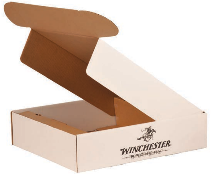
PRINTED DIE CUT MAILER WITH INSERTS

Trinity prides itself in its quality and variety of corrugated products. We can produce cartons in all tests and sizes from small to large quantities. From a standard RSC (Regular Slotted Carton) to the most intricate die cuts, plain or printed.