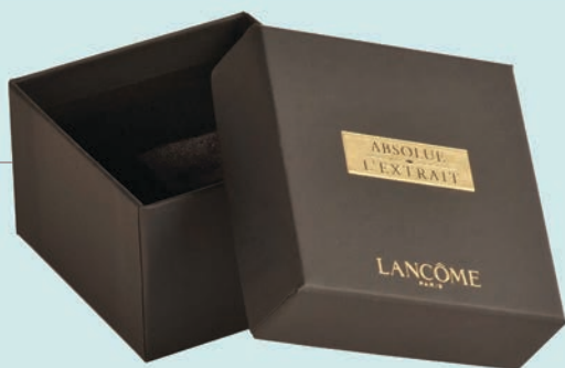
SETUP BOX WITH DIECUT & FLOCKED (VELVET FINISH) POLYURETHANE FOAM