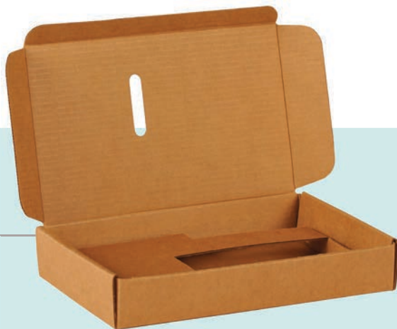
PLAIN DIE CUT MAILER WITH INSERT