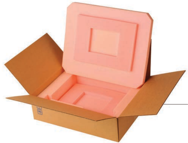
DIE CUT, LAMINATED PINK ANTI-STATIC POLYURETHANE FOAM