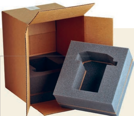
DIE CUT, LAMINATED HIGH DENSITY POLYURETHANE FOAM