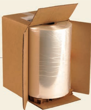
FDA SHRINK FILM