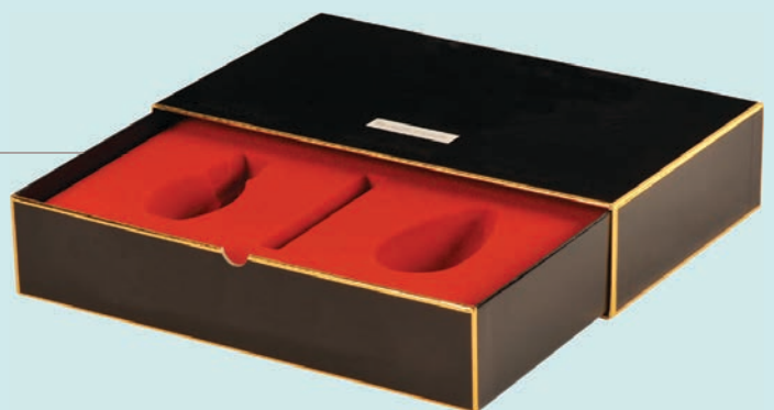
SETUP BOX (SLIP CASE) WITH VACUUM FORMED FLOCKED INSERT