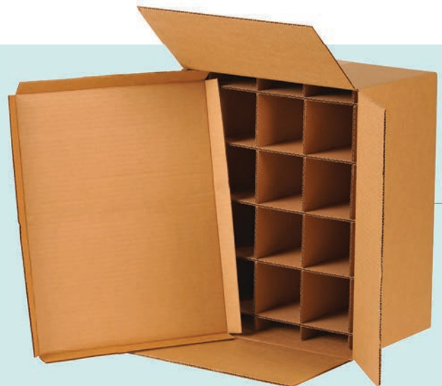
CARTON WITH PARTITIONS WITH TOP & BOTTOM CORNER CUT TRAYS