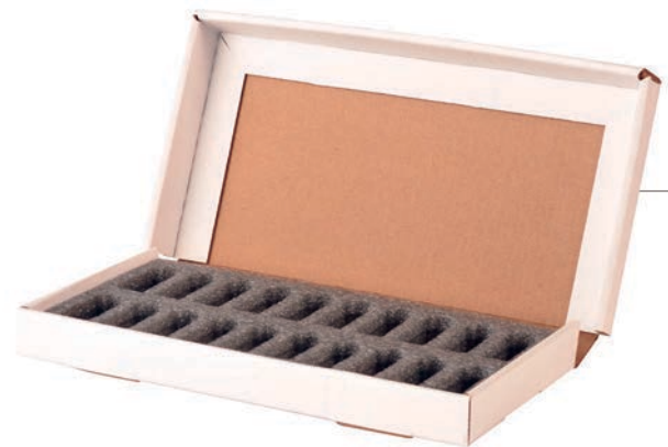
DIE CUT POLYETHYLENE FOAM